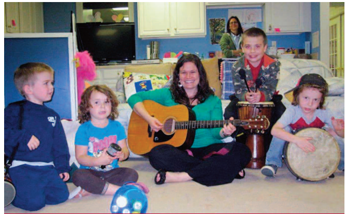
Gilda's Club, music session with therapist

DreamYard is the largest arts education provider in the Bronx reaching 8,500 students, K-12th grade annually. The MMF has given $5,000 to the artists in residence program to fund a music teacher for the year. Through year-long residencies, DreamYard artists teach collaboratively with classroom teachers for 90 minutes per week. Disciplines include theater, dance, visual art, film/video, music and creative writing.